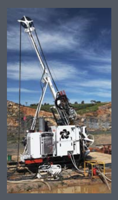
Diamond Coring Rigs