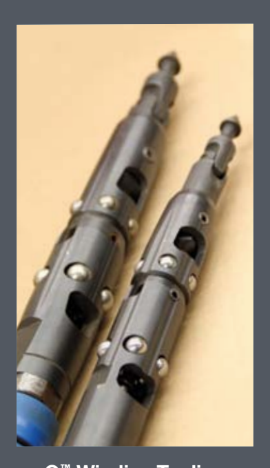
Q™ Wireline Tooling