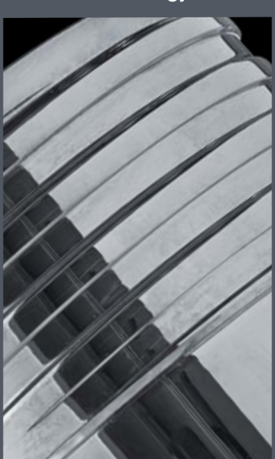
Patented RQ<sup>™</sup> Thread Technology