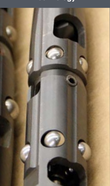
Patented Roller-Latch™ Technology